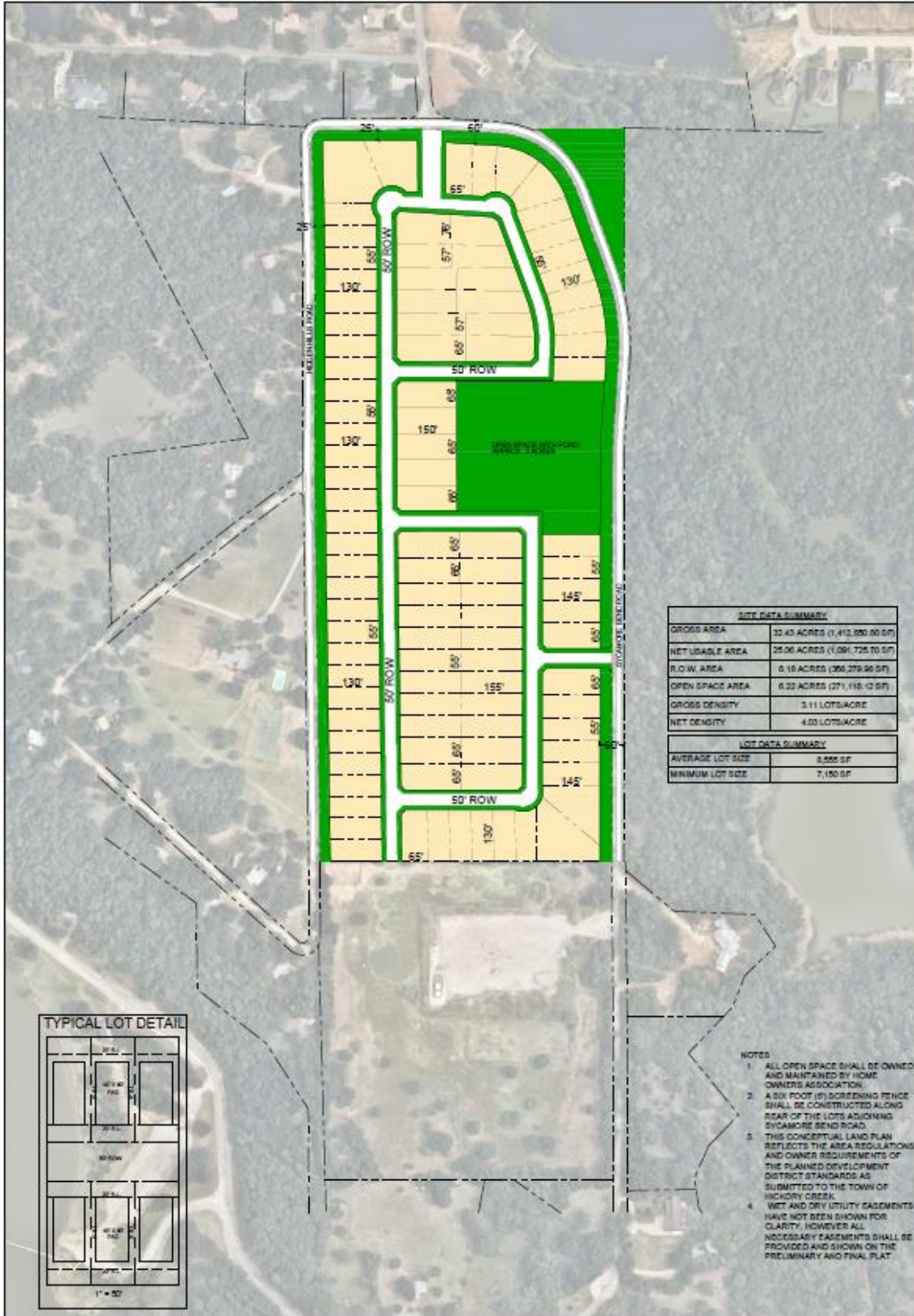
Exhibit C Conceptual Site Plan

SYCAMORE COVE | LOT PLAN PN0519071 | 11.06.2019 | LEON CAPITAL GROUP